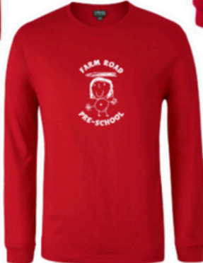
Long Sleeve Tee